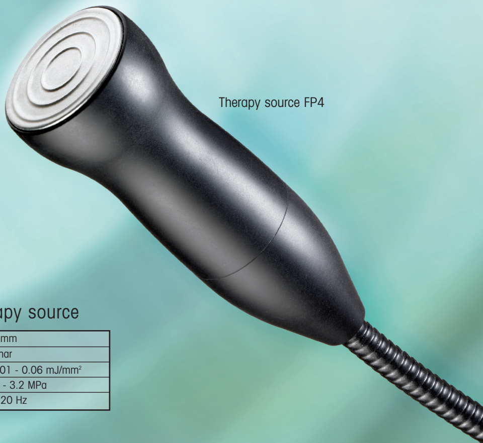
Therapy source FP4